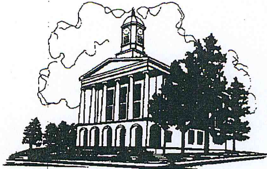
SUSQUEHANNA COUNTY COURT HOUSE MONTROSE, PENNSYLVANIA